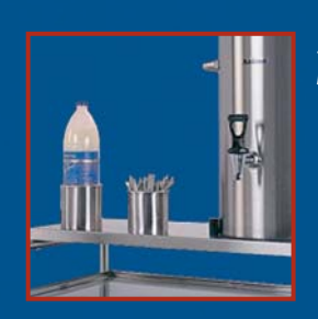
Spoon holder and bottle holder.