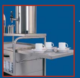
The trolleys can be fitted with up to 2 lift-up side panels.

The trolleys in this range are fitted with sliding rails for stainless steel trays. They offer ample space for cups, saucers, jugs, bowls, etc. These trolleys are large and versatile and, with a few accessories, can be easily converted for use as a multi purpose mobile buffet. The trolleys in this range are closed on three sides and are fitted with drip trays.