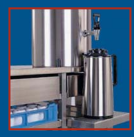
Thermos jug on serving tray (SK 15 VL).